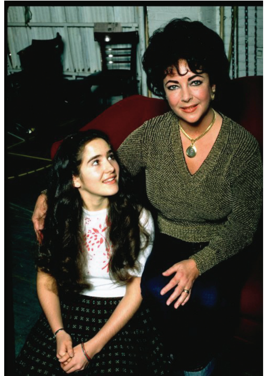
"We opened, May 7, 1981."