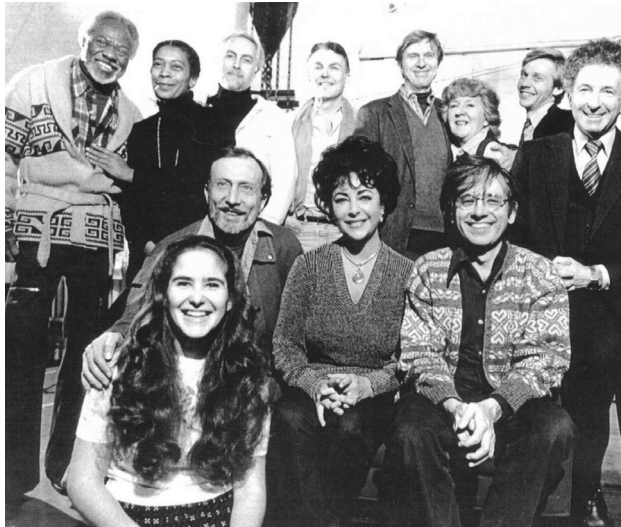
"I got the job!" Rehearsal at The Golden Theatre 1981