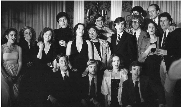
The Williamstown Theatre Festival in 1980 where I met Austin Pendleton The Gershwin Cabaret